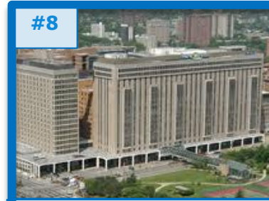
Barnes Jewish Hospital/ Washington University St. Louis