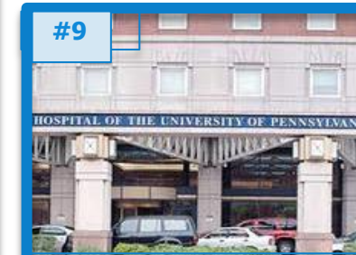
Hospital of the University of Pennsylvania Philadelphia