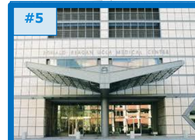
Ronald Reagan UCLA Medical Center Los Angeles