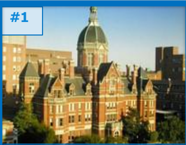
Johns Hopkins Hospital Baltimore