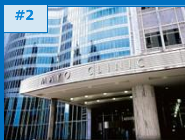
Mayo Clinic Rochester