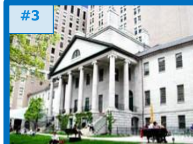
Massachusetts General Boston